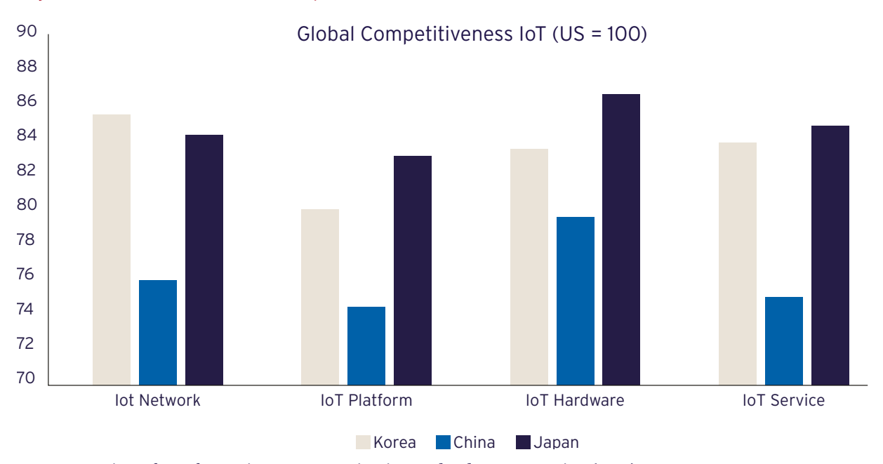
Figure 2: Korea's IoT Global Competitiveness