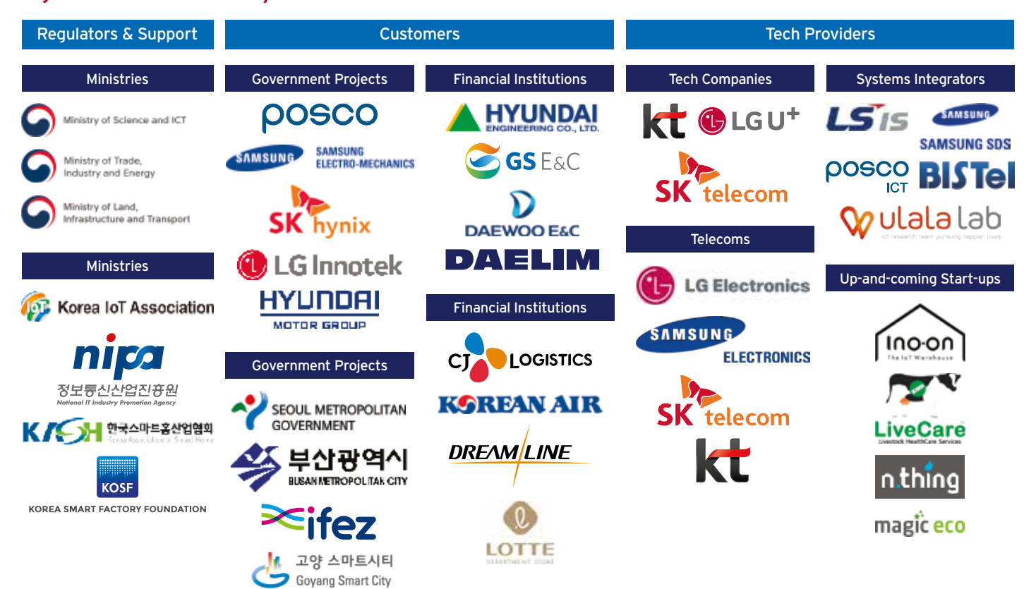
Figure 4: Korea's IoT Ecosystem

The Ministry considers IoT an important future growth engine and one in which smaller companies may be able to succeed in an economy that is otherwise dominated by the large conglomerates. Because most of the companies in the IoT industry are small compared to traditional telecommunications companies, the Ministry has initiated a simplification of the procedures required for IoT operators to broadcast on LPWAN networks with a view to encouraging SMEs to play a major role in this area and tackling the dominance of the larger players in the economy more generally.